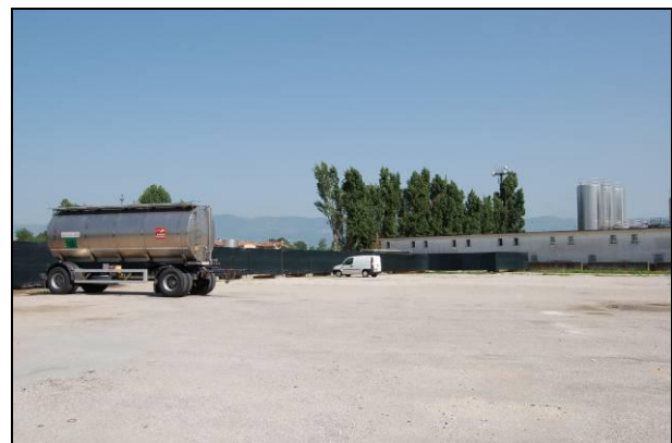
Fig. 5 View of the dairy's parking area

The "Consorzio di Bonifica Pedemontana Brenta" local water authority forbidded the discharge of stormwater from this large newly impervious area into the existing water management system, and imposed the creation of a SUDS system.