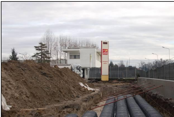
Fig. 2 Installation of the Drening chambers