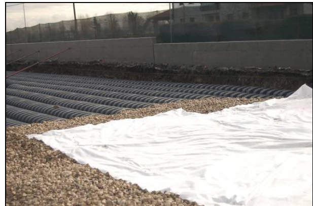
Fig. 3 Geotextile filter laid over the system