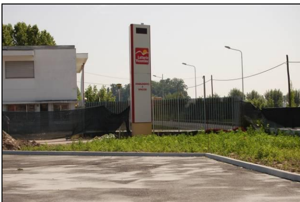
Fig. 4 Carpark and green area