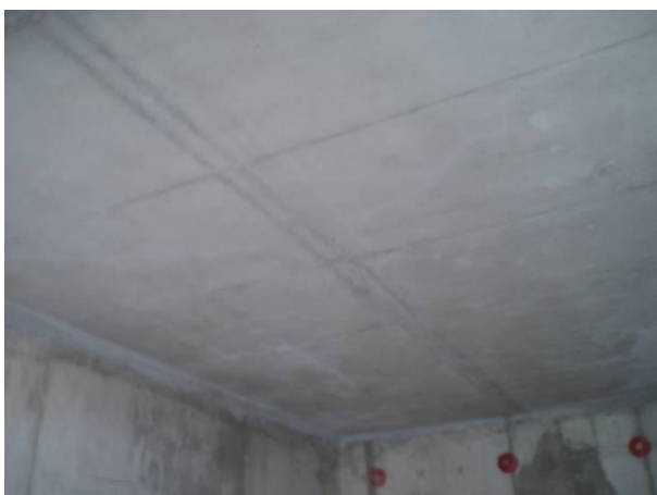
Fig.4 Concrete finish after stripping