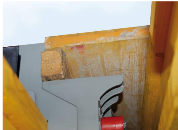
Fig.3 Detail of wood compensation