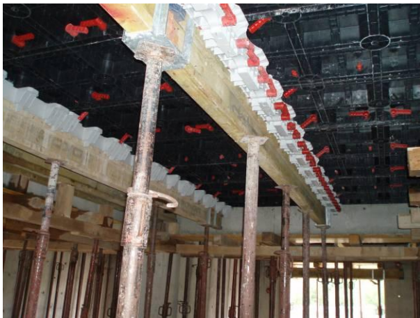
Fig.2 Fully erected Geosky forming system