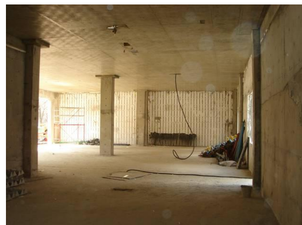
Fig.5 Jobsite view after formwork stripping

The slab surface was divided in three pours, taking advantage of the advanced dismantling properties of the Geosky forming system: it was thus possible to optimise the amount of material deployed and simplify the jobsite logistics.