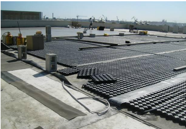
Fig. 1 Installation of Minimodulo on the existing slab