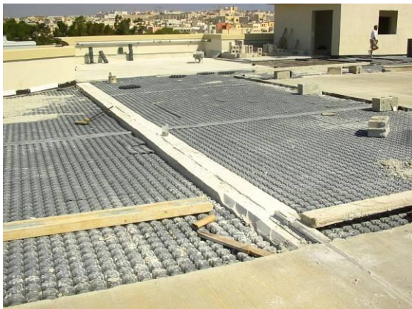
Fig. 3 Pour of the stiffening beams