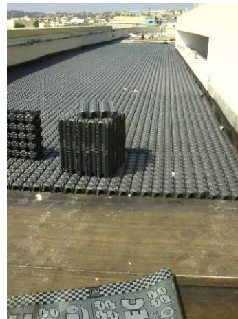
Fig. 2 Detail of the access ramp