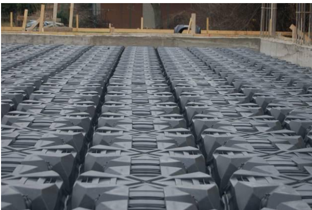
Fig. 3 Installed Modulo