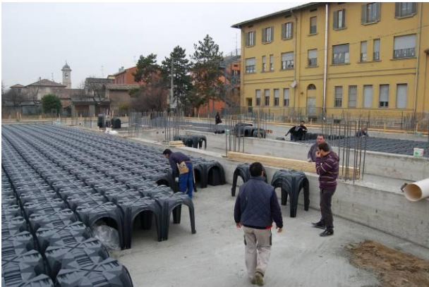
Fig. 1 Installation of Modulo