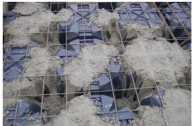
Fig. 4 Initial pour phase (the pockets must be filled first)

This nursery school enlargement project prescribed the use of Modulo H70 to eliminate ground moisture and Radon gas by making the best use of the natural ventilation that is created in the crawls space. A healthy teaching- and play-environment in the building was thus created.